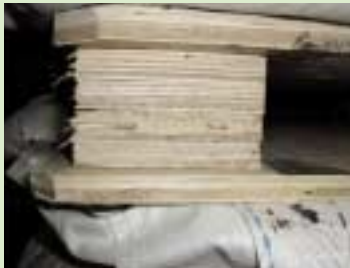
② Pallets made from plywood