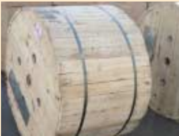
② Wooden Drums