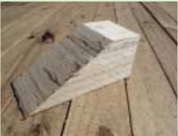
① Wedges made from LVL (laminated veneer lumber)