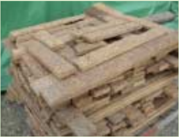
⑤ Dunnage made from particleboard