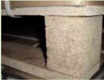
④ Pallets made from particleboard