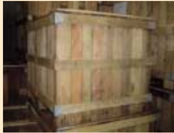
⑦ Wooden Cases