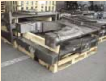
⑨ Wooden Pallets reinforced with Battens

Notice : If these items display the required markings, they need not be subjected to quarantine inspection.