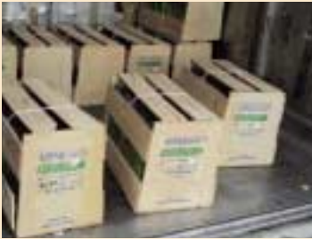
⑥ Wooden Crates