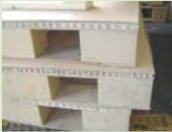
⑥ Pallets made from paper

Notice : These items do not require special markings.