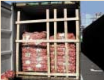
⑧ Wooden Pegs