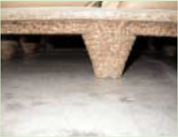
③ Skids made from particleboard