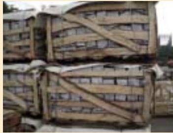
④ Wooden Crates