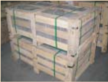
⑤ Wooden Crates